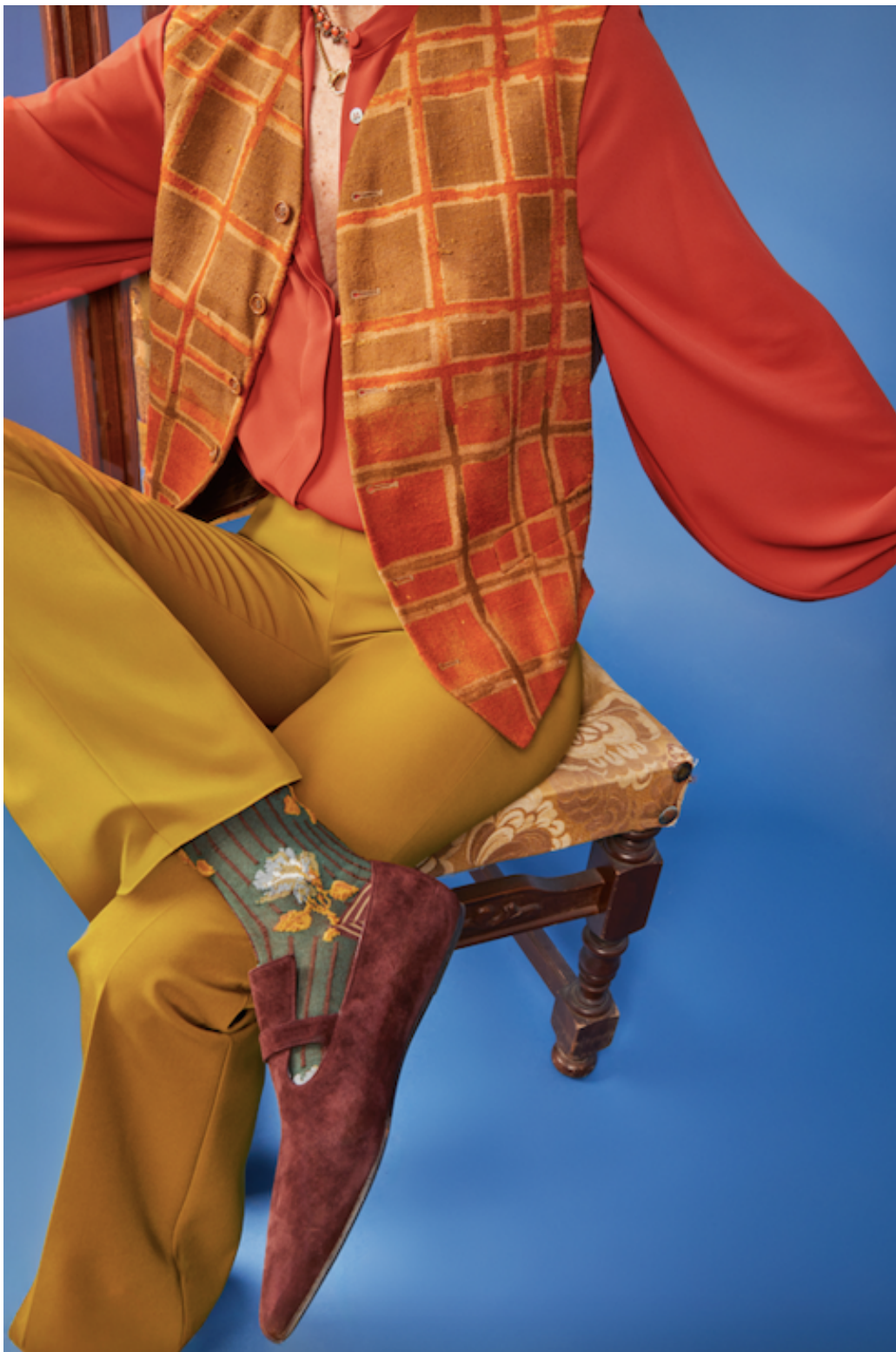
Archival Romeo Gigli vest and shoes.