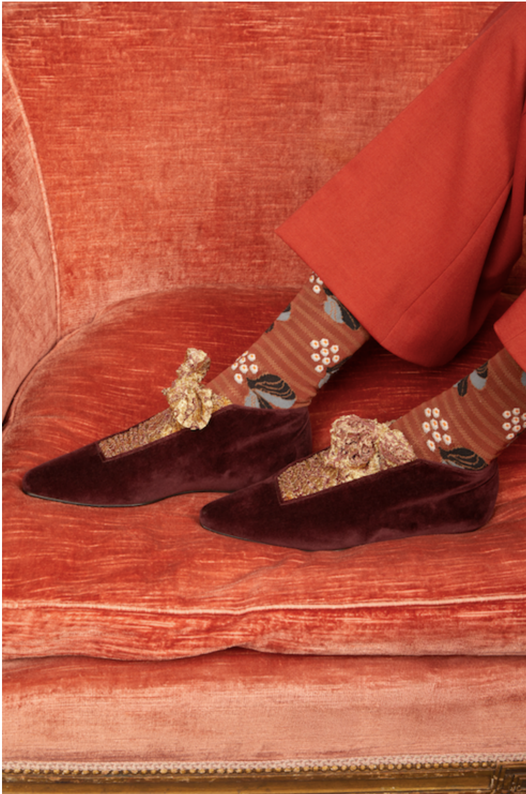
Archival Romeo Gigli shoes.

for international brands such as Missoni, Max Mara, Anna Molinari, Etro, Pinko, SINV, as well as for the Rinascente department store.