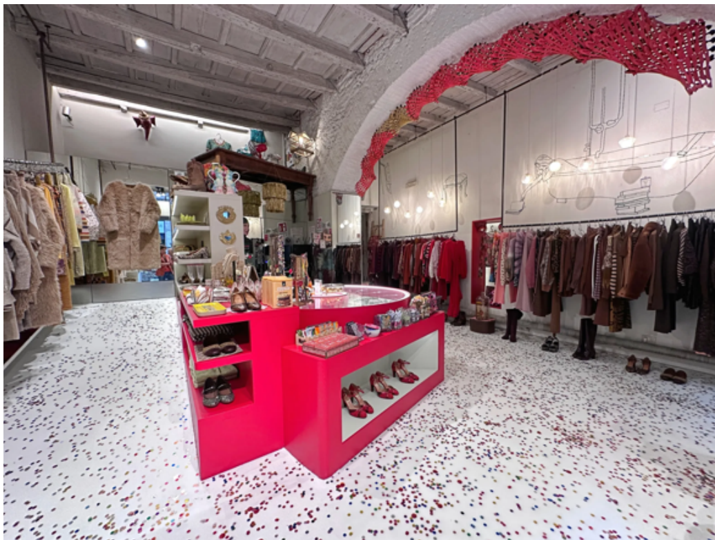
The revamped Wait and See store in Milan.