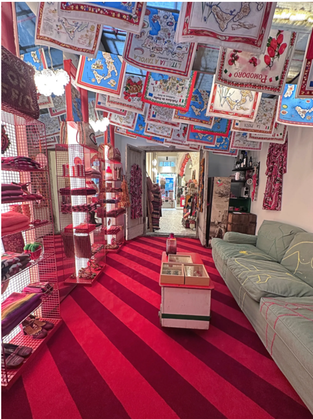
The revamped Wait and See store in Milan.

Tongue-in-cheek elements stand out at the heart of the store, including a sofa embroidered to depict life-sized silhouettes of three nude bodies. Red mesh iron bookshelves and traditional Italian kitchen towels suspended like airy curtains from the ceiling add to the quirky interior.